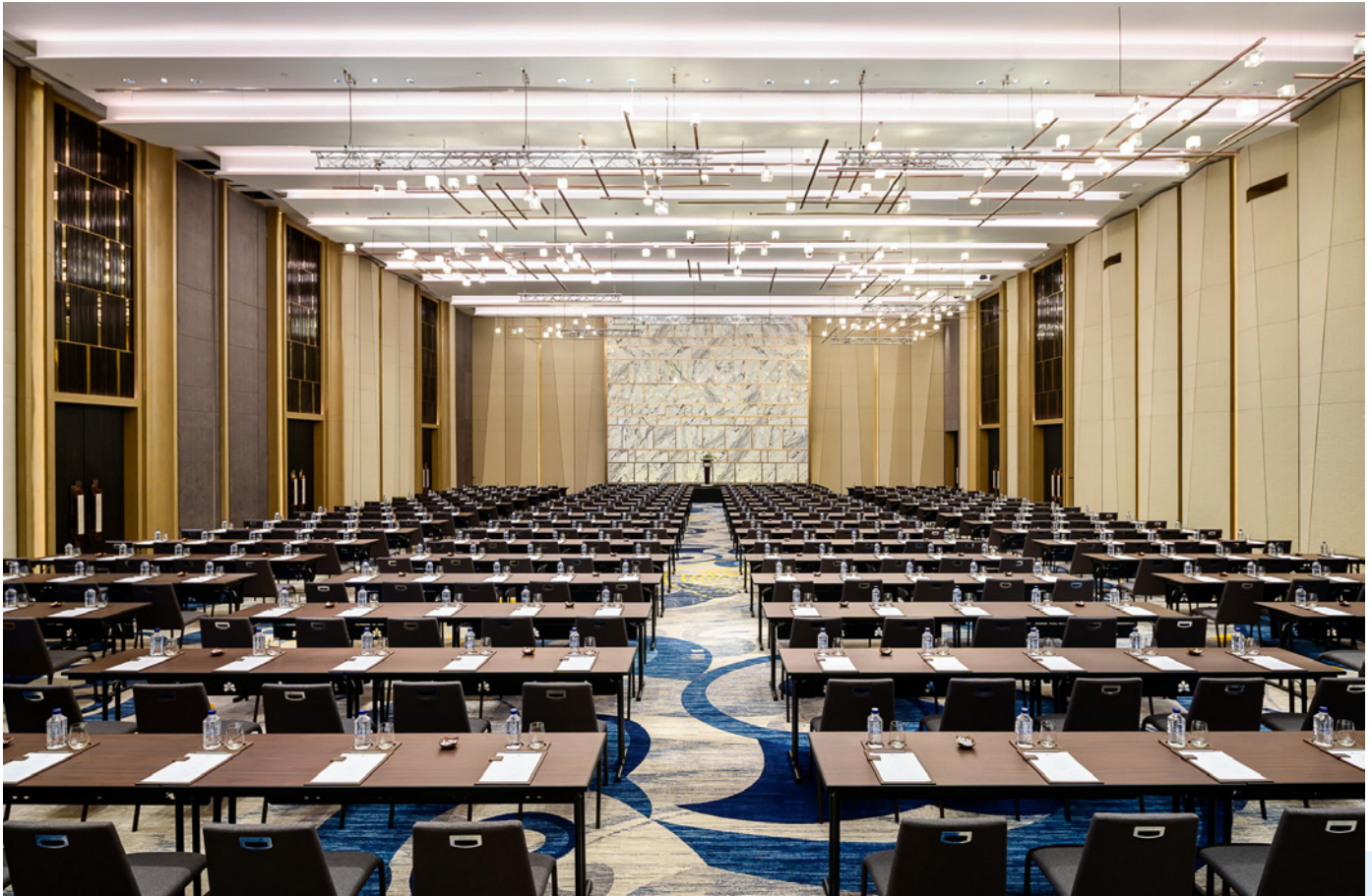
Fuji Grand Ballroom